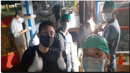
Frontliners in Action