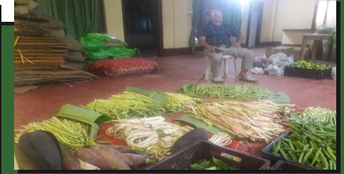
Food Committee Busy Working Behind The Scene