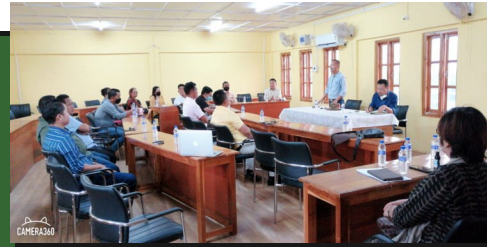
Committee Meeting at Akuvulo