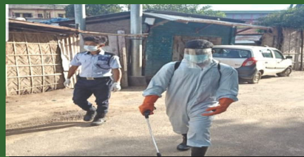
The Management of the Q - Centre @LFI, sanitizing (outside) surroundings