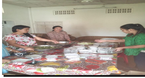
Lunch & Dinner prepared by Chekiye Village STH