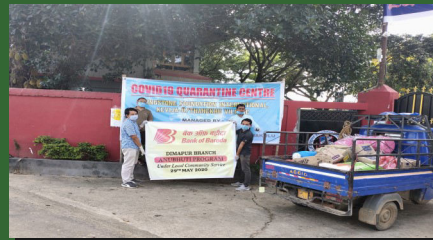
Bank of Baroda Donating Groceries items & Cash