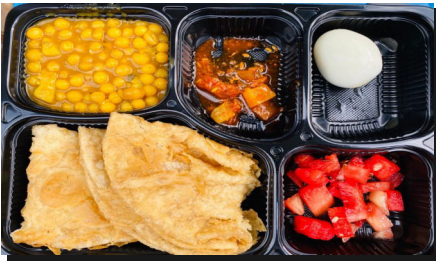
Breakfast Donated by BJYM